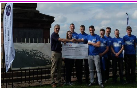
Woodhouse Plumbing, Heating and Electrical Ltd. sponsors of the 12th Frodsham Downhill Run.

Private, individual or group donations can be made online at centre.frodcomm.org.uk or just put a cheque in the post!